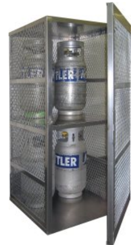
Model #LP8-VERTICAL 65"H x 30"W x 32"D

SECURALL® also offers a comprehensive LP/OG Cylinder Storage Unit that allows for the storage of both horizontal AND vertical cylinders in a combination unit. Combo Unit can store up to 8 cylinders on reinforced 12-gauge aluminum racks or shelves, and up to 10 cylinders vertically. Made of the same high grade .125" thick aluminum and all-welded construction.