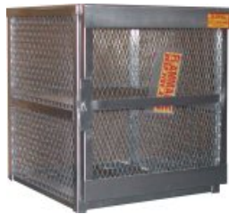
★ Model #LP4 33"H x 30"W x 32"D

Non-sparking Aluminum Gas Cylinder Cabinets provide significant advantages over conventional painted steel models. Designed for outdoor storage using .125" thick aluminum construction, these heavy gauge cabinets will resist weathering and won't corrode or discolor. All-welded 12-gauge aluminum construction features expanded metal sides and doors. Welded padlock hasp is standard for controlled access. Just \frac{1}{3} the weight of painted steel units, SECURALL® aluminum models offer real savings on shipping charges. Models ship fully assembled and ready to use. Labels ship unattached to storage unit for individual placement depending on product application ( as shown at the left ).