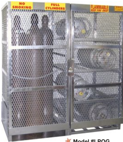
★ Model #LPOG 65"H x 60"W x 32"D

All LP units are available in Vertical Storage Models at no additional charge. Simply add the suffix VERTICAL to your PO! Vertical LP Storage Units comply with CSAB 149.2, Canadian Standard for Liquid Propane Storage .