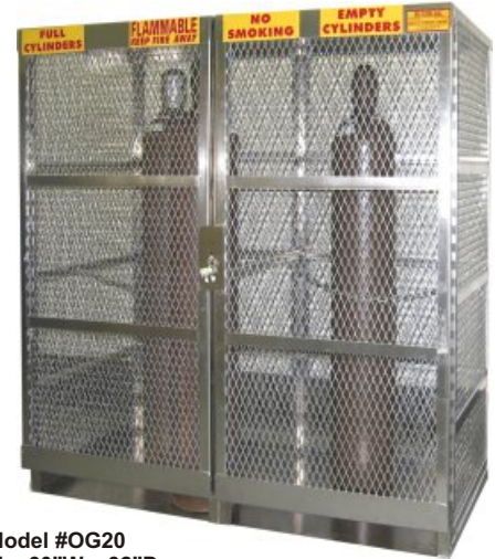
Model #OG20 65"H x 60"W x 32"D