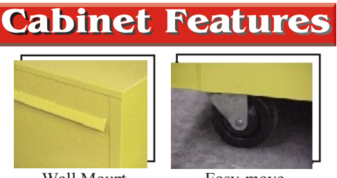
Wall Mount Brackets