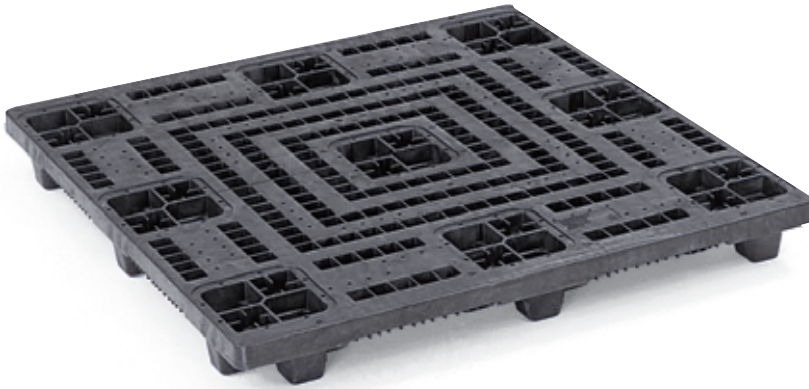
Nestable 48 x 48 CISF Pallet

The nestable ORBIS 48 x 48 CISF Pallet is known for its superior quality and durability. The flat deck design accommodates multiple material handling requirements. This is a general purpose pallet ideal for virtually any application.