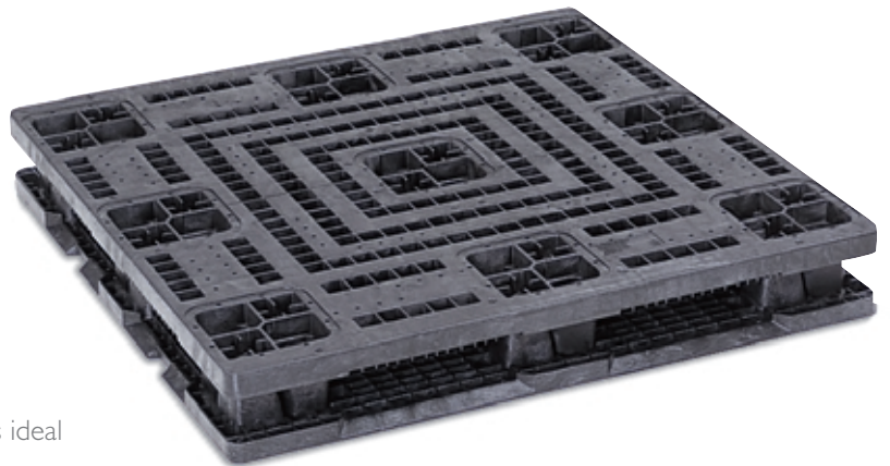
Stackable 48 x 48 CISF Pallet

The stackable ORBIS 48 x 48 CISF Pallet is ideal for use on roller conveyors and any type of standard racking system. The double-deck rackable design offers versatility in many applications.